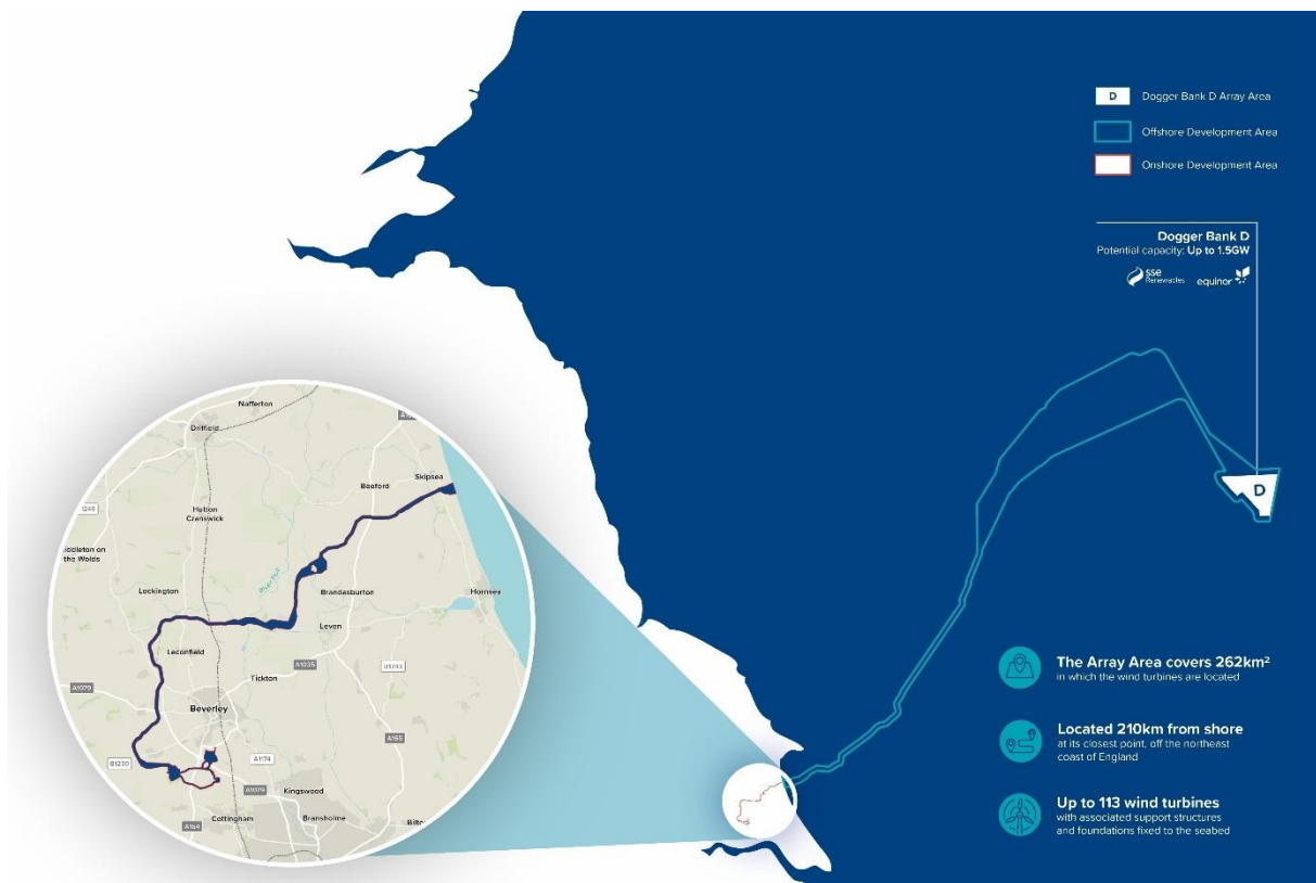
Plate 2 Onshore and Offshore Project Plan